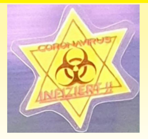
Neo-Nazi sticker in Germany

— Kaos en la Red Far-Left Spanish Website