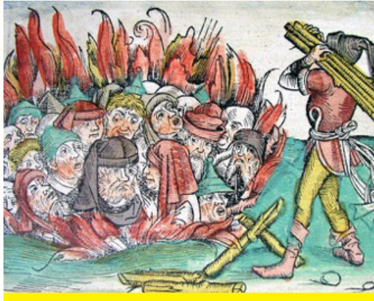
A 14th century drawing depicting Jews being burnt alive during the Black Plague.

This was the Middle Ages, before modern scientists understood that viruses and bacteria cause disease. At the time, superstition filled the void.