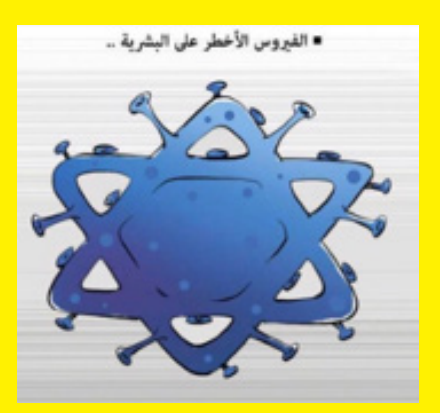
"The Most Dangerous Virus To Humanity" – cartoon in a Palestinian Gazan newspaper