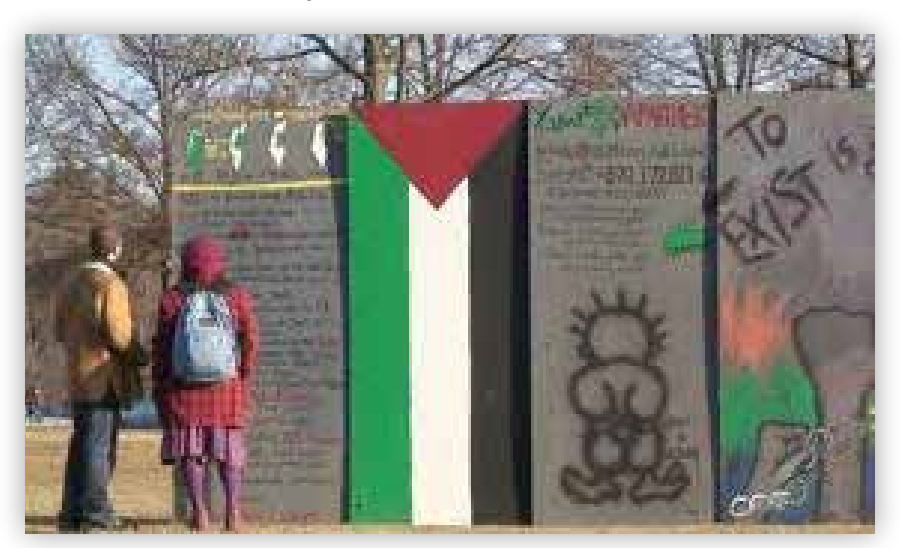
Anti-Israel "Apartheid Wall" display, which is taken to North American college campuses.